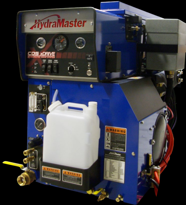
CDS xDRIVE ACCELERATED DRIVE SYSTEM