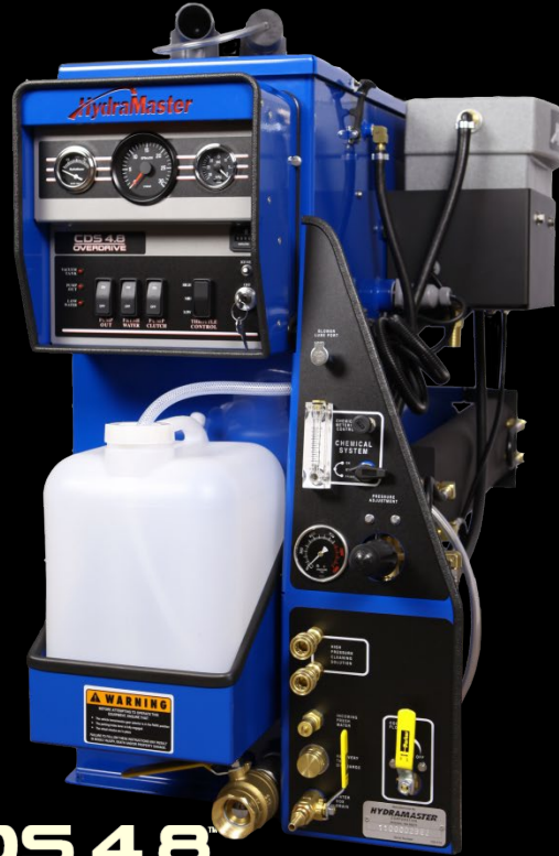
CDS 4.8 OVERDRIVE